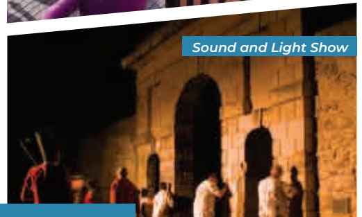
Sound and Light Show