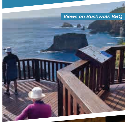
Views on Bushwalk BBQ

Take a short flight from Sydney and you will find yourself in one of Australia's most fascinating and historical destinations. Settled by descendants of mutineers who speak a mix of Tahitian and 18th Century English, it's a friendly place where giving a small 'Norfolk Wave' as they pass each other is almost mandatory, Cows have right of way and everyone knows everyone else.